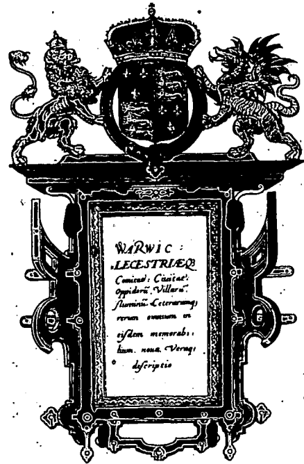
Cartouche from Saxton's map of Warwickshire and Leicestershire