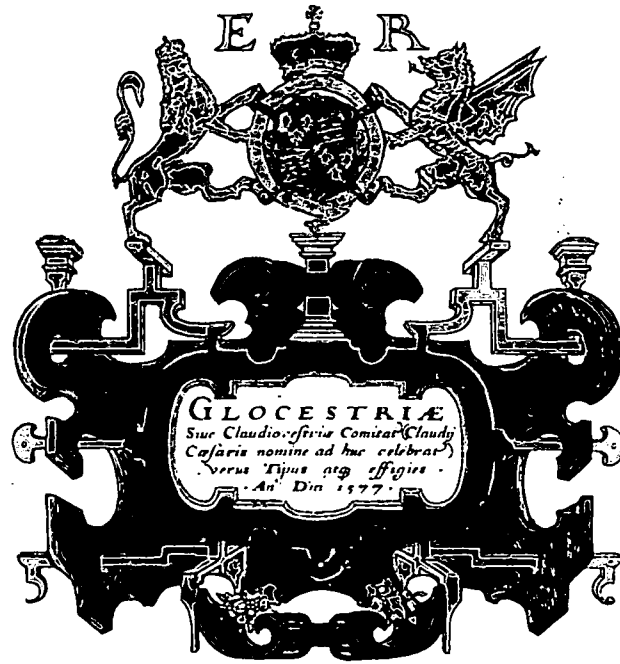
Cartouche from Saxton's map of Gloucestershire

It is interesting that on Saxton's map are shown The Vynyard just south of Tewkesbury and the Vinyerd west of Gloucester.